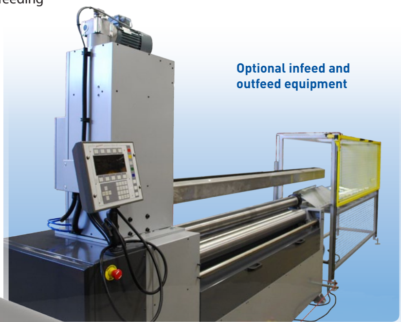
Optional infeed and outfeed equipment